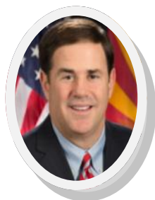
Governor Doug Ducey