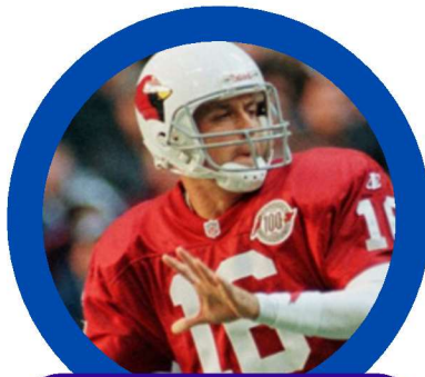
JAKE PLUMMER Keynote